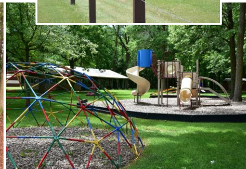
Trail access at park or Keller St.

Contact Forest Junction Civic League to rent the park facilities for your gathering or celebration. fjcl@tds.net